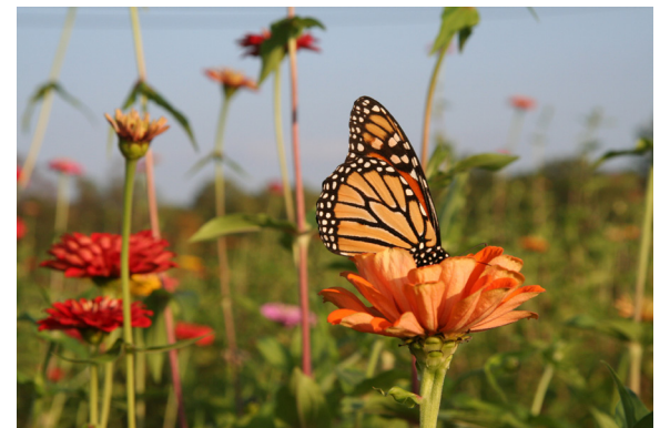
Monarch on flower by Ilene Levine.

We have flowers of all shapes and sizes. Many of the crops started as a flower. Apples to strawberries, acorn squash to zucchini, wine grapes and even tomatoes, all started as flowers. In early summer, the smallest flowers on the farm are in bloom in the vineyard with tiny white spikes poking out of preliminary clusters to later form into individual grapes.