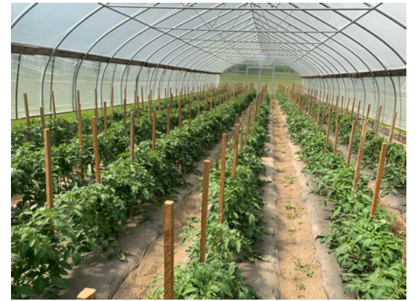
Tomatoes in high tunnel.

When we say we have fresh vegetables all year long, we really mean it. We pick fresh crops daily all year. To achieve this with good planning, we can overwinter crops in low tunnels (small hoops of metal covered in plastic) and grow crops in high tunnels (large greenhouses that are not heated, where we grow directly in the ground) and grow crops production in our greenhouses (heated spaces with cement floors). To keep ourselves organized and our faithful customers supplied with fresh vegetables, we have over 700 separate entries in our planting plan regarding date, amount and type of seed so we can have sequential and properly planned plantings.