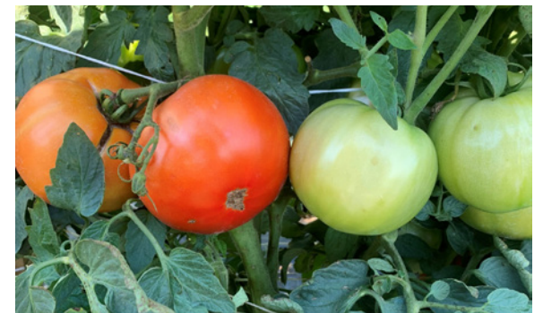
Tomatoes on the vine.

We are producing all year around, but we get especially excited to see the early spring crops such as asparagus because it marks the beginning of our busiest growing season. After winter, the asparagus, spinach, kale, beets and broccoli are all early crops that are welcome additions to our plates.