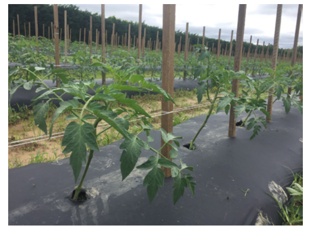
Tomatoes in field.

We can extend the season of many crops using this combination of low tunnels, high tunnels, and greenhouse space. For example, tomato plants are started in the greenhouse from seed. We heat treat our seeds before planting which kills any seed-borne pathogens. When growing organically, planning and prevention is the name of the game. When the transplants are ready, we plant them first into our high tunnels and later plant into open field plant, for our field tomatoes. This allows us to not only have earlier tomatoes due to the favorable conditions in the high tunnel, but we are also able to increase the reliability of our season. If it is too wet, often tomatoes grown in the high tunnels do better but if it's hot the field tomatoes do better. Over the years, we find that a variety of growing styles and range of different crop varieties helps ensure longer growing seasons and more reliable supply.