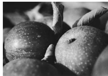
First Place –Heather Diskin "Apples"